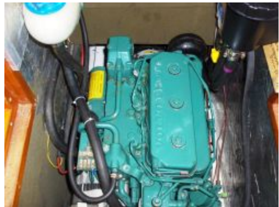
Volvo Penta diesel engine