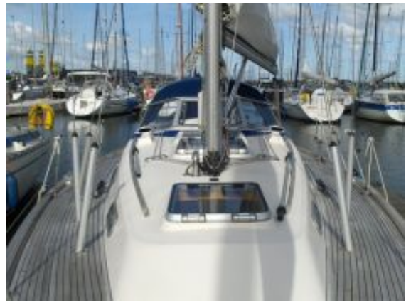
deck looking aft