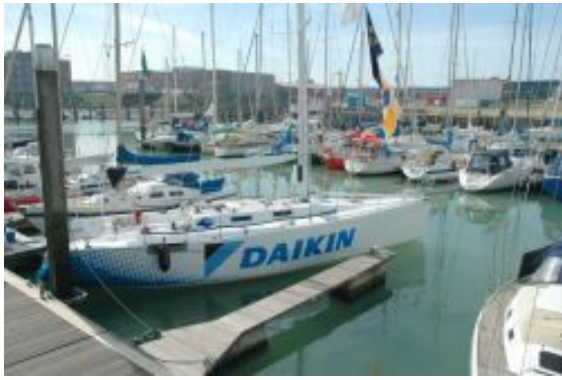
on the hard