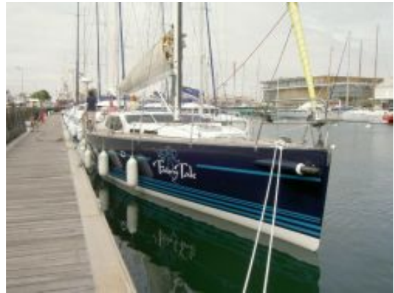
in harbour bow