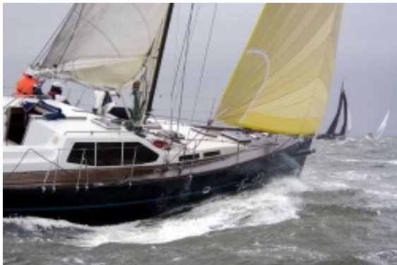
sailing st b